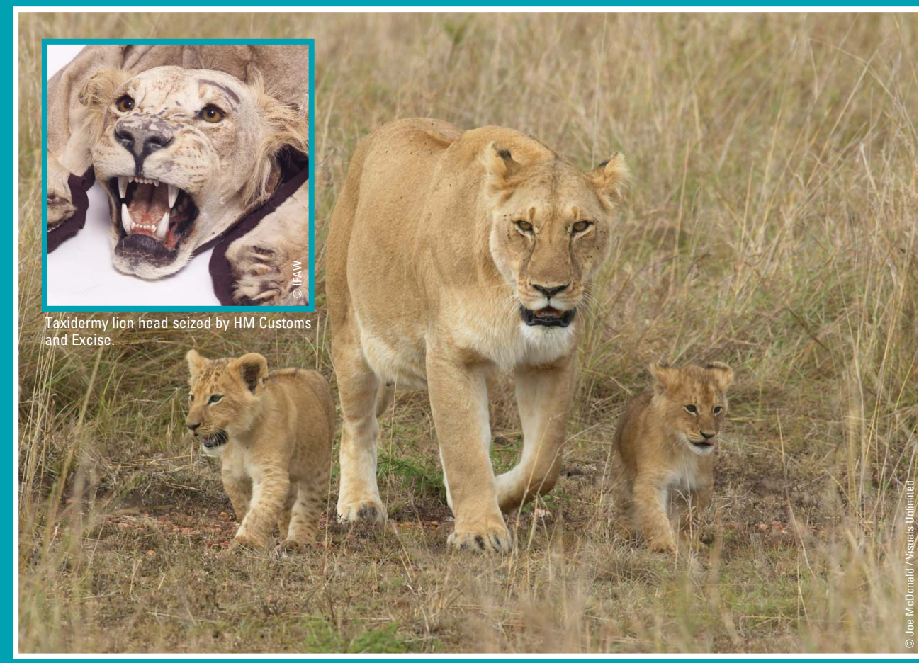
Lion numbers have plummeted from an estimated 200,000 to just 23,000 in the past twenty years. Yet people still kill these kings of the animal kingdom for trophies and furs.