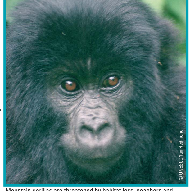
Mountain gorillas are threatened by habitat loss, poachers and trade in their meat and parts.

Like all Great Apes, gorillas are listed on CITES Appendix I, prohibiting all international commercial trade by Parties. This case is particularly disturbing because of the welfare implications involved. Gorillas need highly specialist care and it is extremely unlikely the physiological and behavioural needs of an individual animal can be met in captivity. IFAW referred this case straight to the London Metropolitan Police Wildlife Crime Unit for investigation.