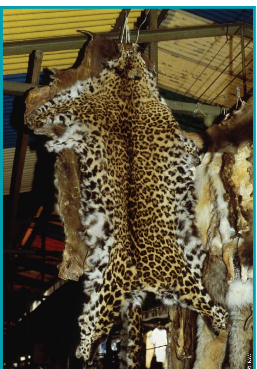
A leopard skin hangs for sale among other animal skins in Quing Ping Market in China

In November 2004, a European Commission working party adopted an opinion on the storage and retention of data available within public communications networks for the prevention, detection and prosecution of criminal acts.<sup>117</sup> This was in response to a draft EU decision, the essence of which is to reflect the balance between the rights of privacy, especially those set out in article 8 of the ECHR, and retention of communications data. To conform with article 8(2) of the ECHR, the following conditions must be satisfied: there should be a legal basis to any interception; the measure should be needed in a democratic society; and it should follow one of the legitimate aims of the convention.