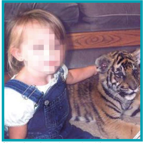
Girl petting a tiger cub as made public on www.wildanimalworld.com. IFAW has obscured the child's face to protect her identity.

Despite their status as one of the most endangered species on the planet, IFAW found tigers – dead and alive – for sale over the Internet. A tiger skin bag found for sale on eBay™ was reported twice by IFAW but the item was not removed.<sup>89</sup> It sold for £21. Made from genuine tiger skin, the seller claimed, "this is your chance to grab a very rare bag indeed".