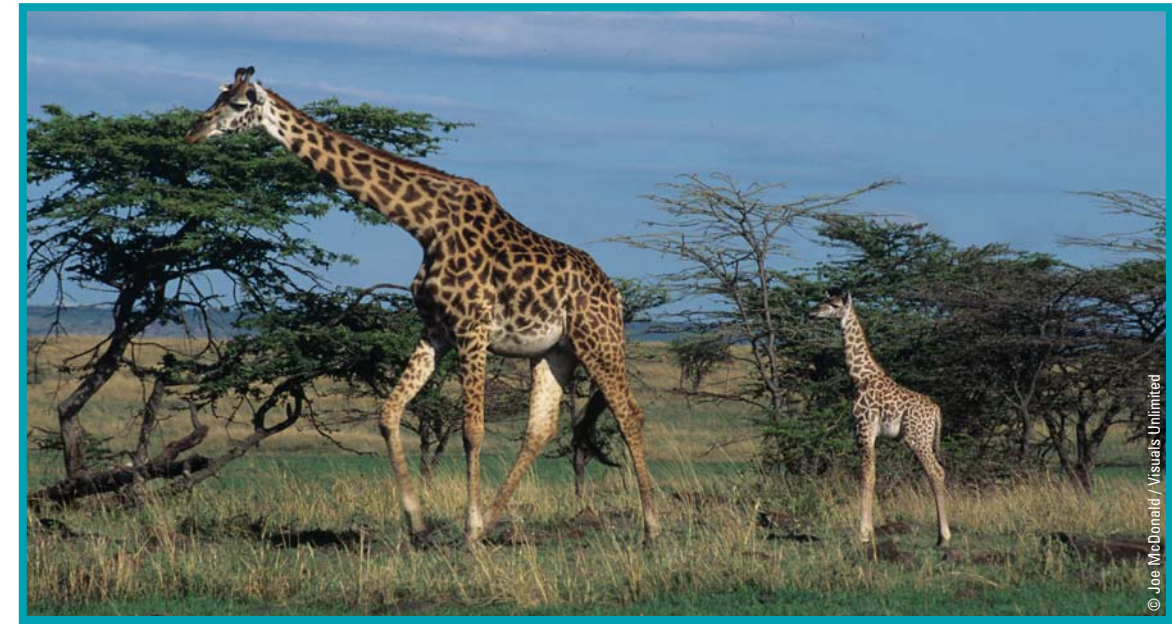
Even the tallest of African mammals, the giraffe, is not exempt from the exotic pet trade.

Although not endangered, giraffes in countries like Kenya are falling victim to increased levels of poaching to supply the bushmeat trade. Crude snares fashioned from telegraph wires are hung from trees at certain heights to ensnare giraffes by their necks while grazing. Giraffes are savannah animals, and at up to 4 metres high are biologically adapted to their natural habitat. It is highly questionable whether the needs of these tree-top grazers can be adequately met by private "pet" owners. The welfare implications for individual animals kept in captivity are acute.