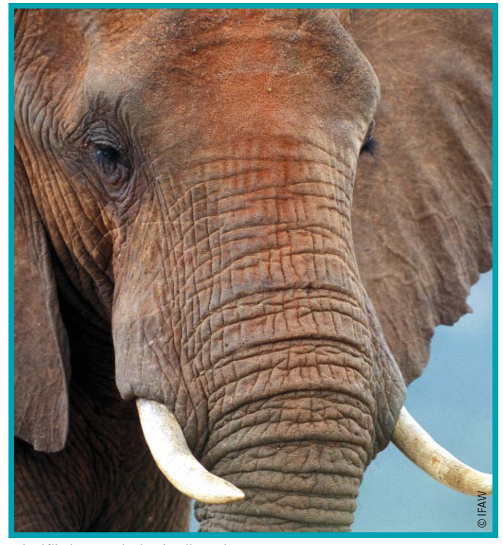
Carved ivory jewellery comes at a great cost - elephants must be killed to supply the deadly trade.

Elephants in Africa and Asia are endangered, victims of rampant poaching for the ivory trade. African elephant numbers plummeted from an estimated 1.3 million to 625,000 during the 1980s because of widespread ivory poaching. Fuelled by the demand for their sought-after "hard" ivory, poaching has significantly changed the population dynamics of Asian elephants, which are estimated to number just 35,000 to 50,000 in the wild. Forest elephants in Central and West Africa are also vulnerable because of poaching for ivory and bushmeat, combined with habitat loss.