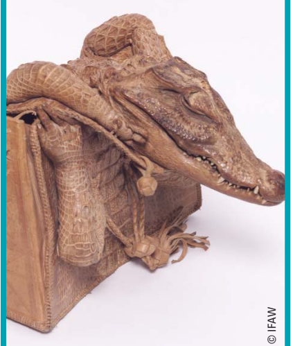
Species for sale: a selection of the types of wildlife products for sale online