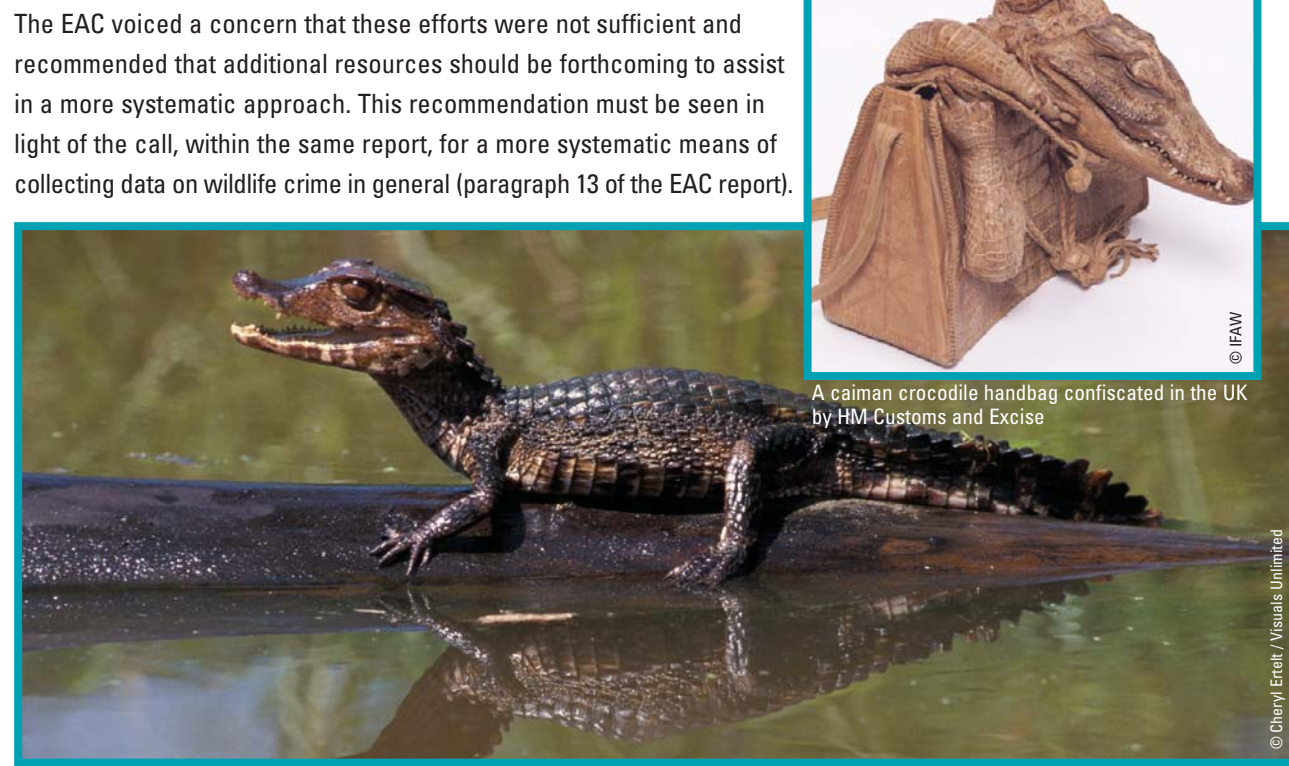
Dwarf caiman crocodiles are victims of wildlife trade because of their scaly skins, commonly used in bags, shoes and ornaments.

The EAC was told that the National Wildlife Crime Intelligence Unit (NWCIU) is also taking action in this area: collaborating with auction sites; working proactively to develop actionable intelligence from information obtained from such sites; and monitoring wildlife sales on other types of sites.