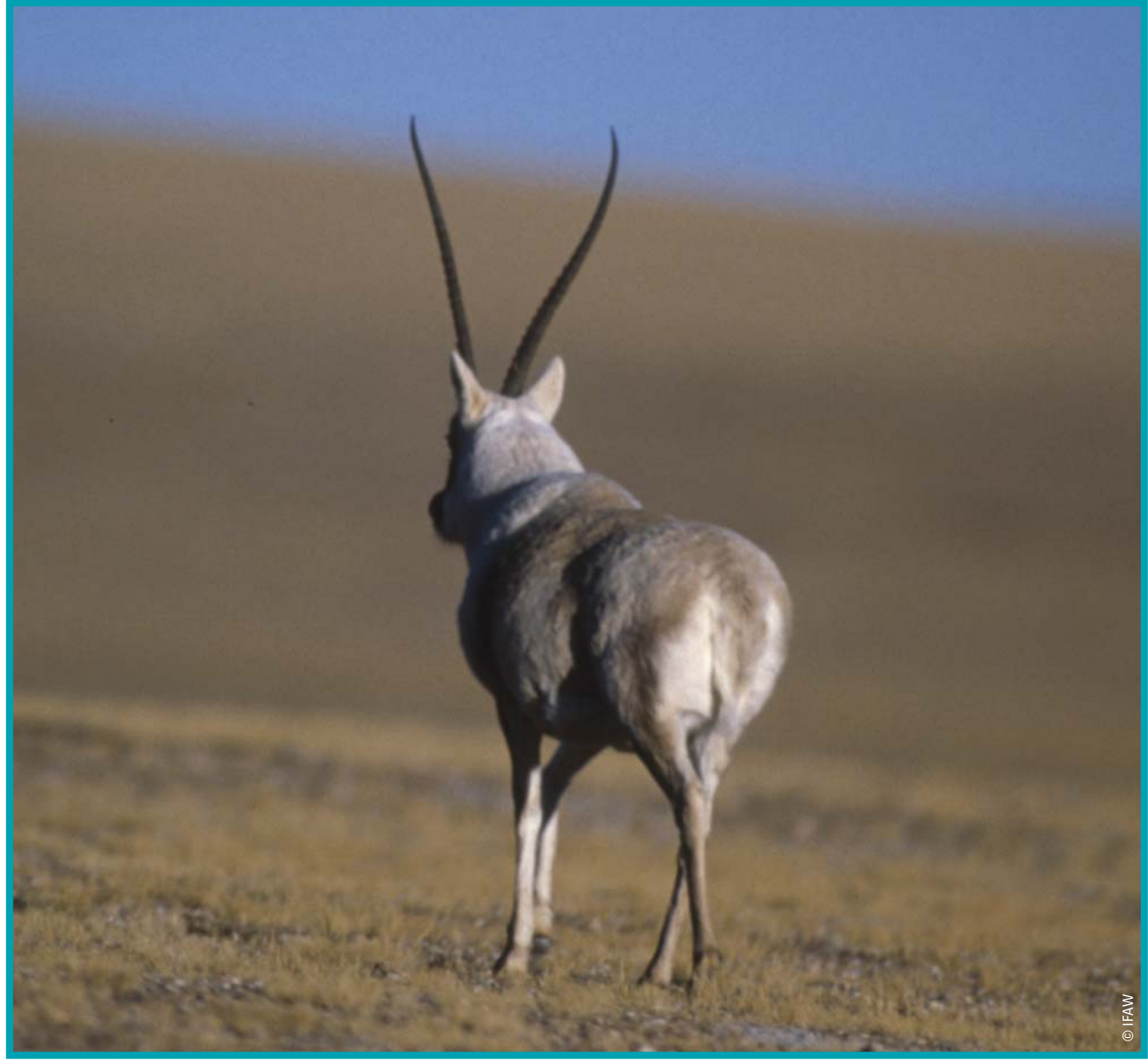
The Tibetan antelope faces extinction due to poaching for its highly prized fine wool.

With the growing number of traders and consumers, and the difficulties of enforcing the law, the need to tackle the use of the Internet to trade illegally in wildlife grows more and more acute. Whether or not traders are aware that they are breaking the law, the negative impact on endangered species and on the welfare of individual animals is the same.