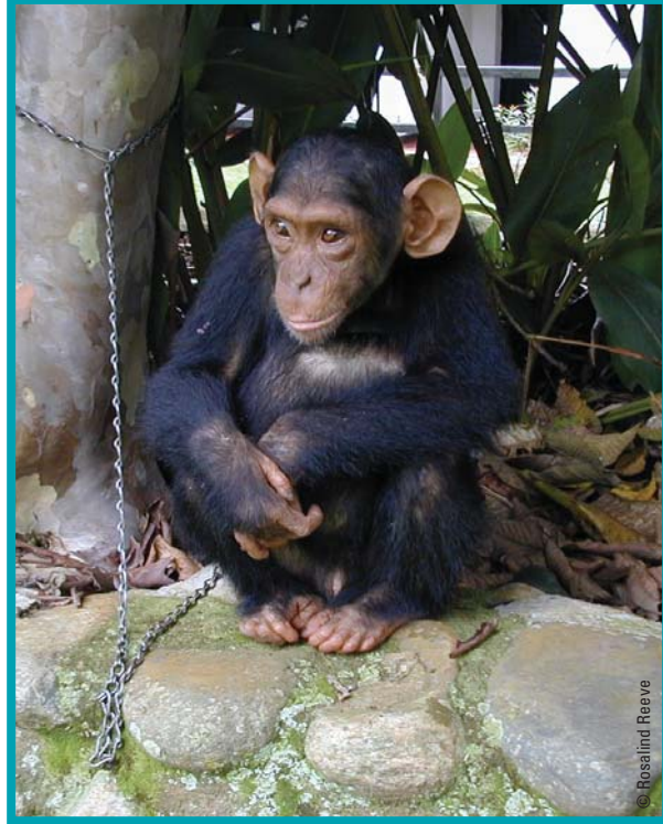
Wild caught juvenile chimpanzee sold as a pet in the Democratic Republic of Congo, about to be smuggled to Russia.

Chimpanzees, so closely related to humans that our DNA differs by just over one percent, are highly endangered in the wild due to habitat loss, the bushmeat trade and poaching for live animals for the exotic pet trade. Down from an estimated one to two million a century ago, chimps today number as few as 150,000 in the wild.<sup>33</sup> They are protected from international commercial trade through a CITES Appendix I listing. Anyone caught importing a wild-caught chimp into the UK for commercial purposes is likely to face criminal charges, as they would be breaching EU law.