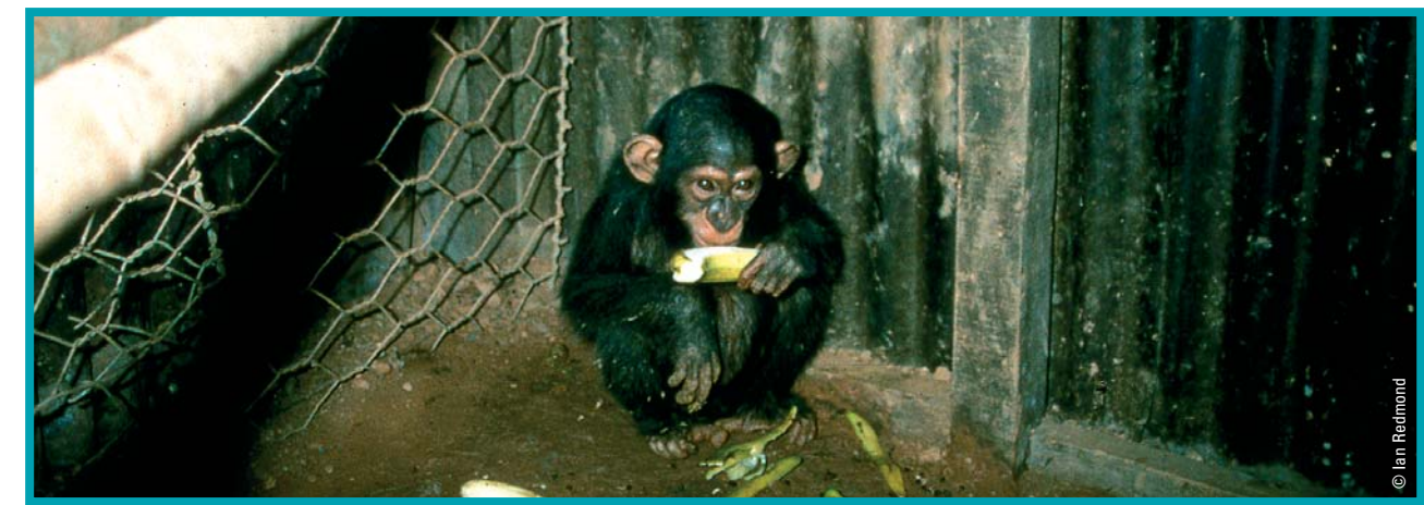
Infant chimps, many orphaned by the bushmeat trade, often end up being sold as pets.

The regulation of the Internet trade in pet animals is being specifically considered in the context of the new Animal Welfare Bill.<sup>34</sup> Annex D of the draft Bill states: "It seems reasonable that if animals are being sold from sites in England and Wales then [businesses] should be expected to comply with minimum welfare conditions. A possible option would be a statutory code of practice applying to all internet sales." This is a positive proposal, especially since a statutory code of practice would be legally binding. However, it is also noted that the Government's policy in this area is still "to be agreed" (see Annex L); and the Government elsewhere recognises "the difficulties in regulating Internet activity and accept[s] that the production of regulations and a code within a year may prove too ambitious a timescale".<sup>35</sup>