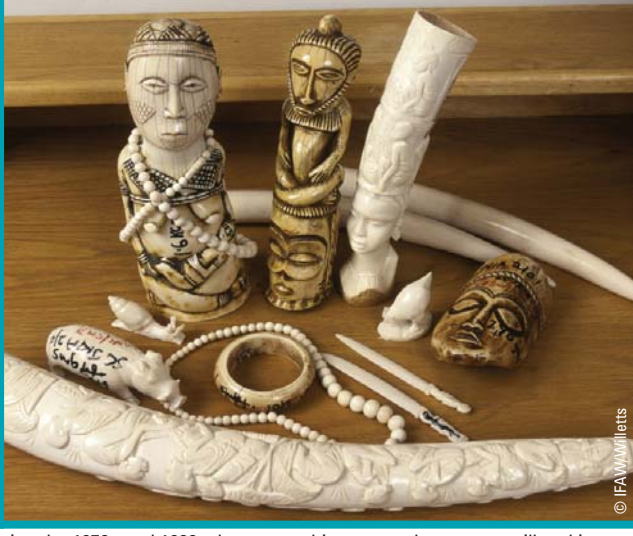
African elephant numbers plummeted from 1.3 million to as few as 625,000 during the 1970s and 1980s due to poaching to supply a rampant illegal ivory trade. Many populations are still threatened by poaching for ivory today. Right: Confiscated carved ivory products in Kenya.