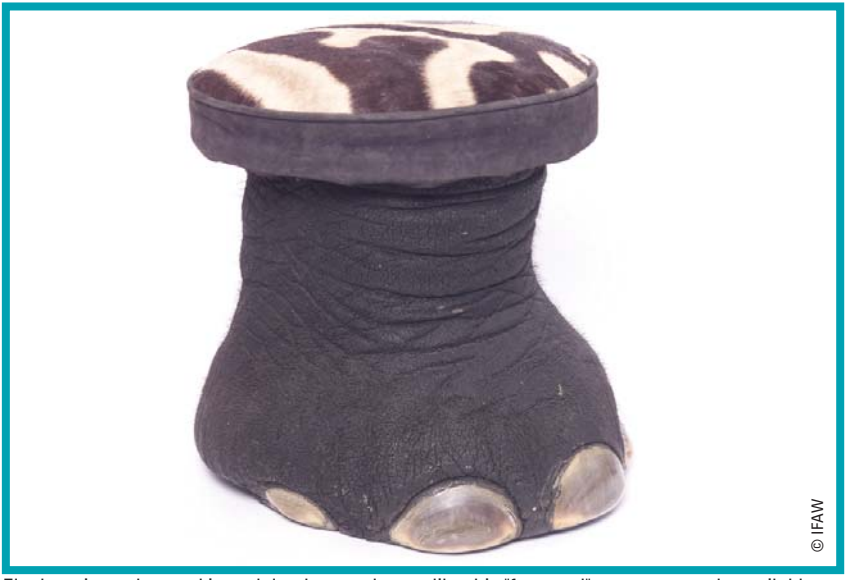
Elephant ivory, bone, skin and leather products - like this "footstool" - are commonly available on the Internet

Elephant products – 5,527 individual elephant products and 11 traders. Items listed for sale included: skin/leather products such as boots, wallets, purses, footwear and bags; bone products such as carvings, jewellery, a Mah-jong set and fans; and ivory products such as jewellery, boxes, chess sets, ornaments, and expensive sculptures, including one with an asking price of US $18,000. Ivory items also ranged from the more traditional (piano keys) to the clearly contemporary (such as the ivory "functional" telephone with a touch-tone pad).