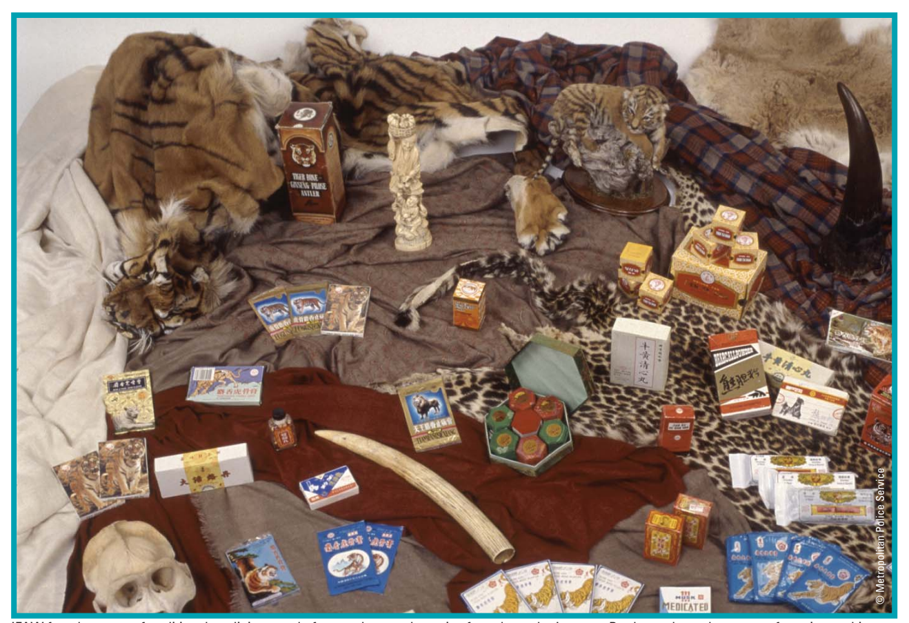
IFAW found a range of traditional medicines made from endangered species for sale on the Internet. Products shown here come from tigers, rhinos Tibetan antelope and elephants.

Sadly the current legal framework and enforcement efforts are inadequate to deal with this appalling situation and protect the species and individual animals involved. A more effective response is essential. Accordingly, this report presents the results of a preliminary investigation by IFAW into Internet wildlife trade and examines the nature of Internet trading in general and the legal framework in which it currently takes place. It considers areas of Internet-related crime where more effective regulation and enforcement are already in place and draws lessons for strategies and enforcement techniques that could be employed to tackle the use of the Internet for the illegal trade in wildlife.