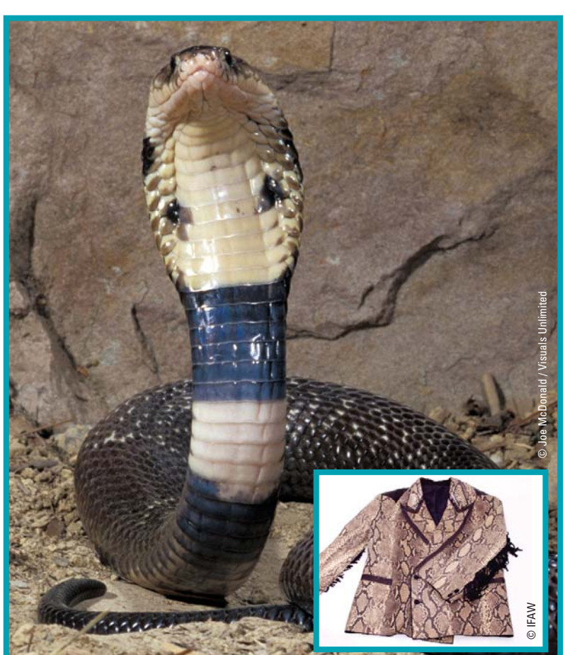
Commercial trade in Asian cobras is prohibited. Right: snakeskin fashion items, like this cobra skin jacket, are commonly traded on the Internet illegally.

In response to a report by the Internet Crime Forum (ICF),<sup>72</sup> in March 2001 the Home Office also established the Internet Task Force for Child Protection on the Internet, comprising representatives from Government, the police, industry, and child welfare organisations.<sup>73</sup> The Task Force has published a series of guides for young people, parents and carers, and the industry, to encourage safe use of the Internet and easy reporting of abuse. Considering this initiative along with the work of the IWF and internationally coordinated efforts, it appears that a robust response has been adopted to what is universally perceived to be the worst social problem involving the Internet.