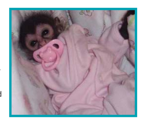
Spider monkey dressed as a baby

IFAW fears that many of those purporting to want a monkey are woefully unequipped to deal with the considerable welfare needs of a captive primate. There is also no way of distinguishing between captive bred and wild caught animals by the online description provided, leading to concerns over the conservation of these animals in the wild. The greater the demand for these animals, the greater the levels of poaching, as smuggling becomes a profitable enterprise.