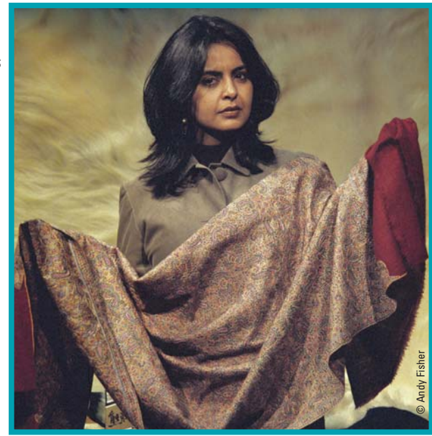
A luxury shahtoosh shawl seized by police in London.

The Tibetan Antelope is listed on CITES Appendix I. Despite increased international enforcement efforts to crack down on the illegal trade, it appears that some traders - like our Indian seller - remain determined to flout international law. A UK buyer could have the item confiscated and face a heavy fine or even jail sentence if caught importing shahtoosh into the country. In India, it is also strictly prohibited to trade in shahtoosh, and those who breach the law face between three and seven years' imprisonment and a hefty fine.<sup>25</sup>