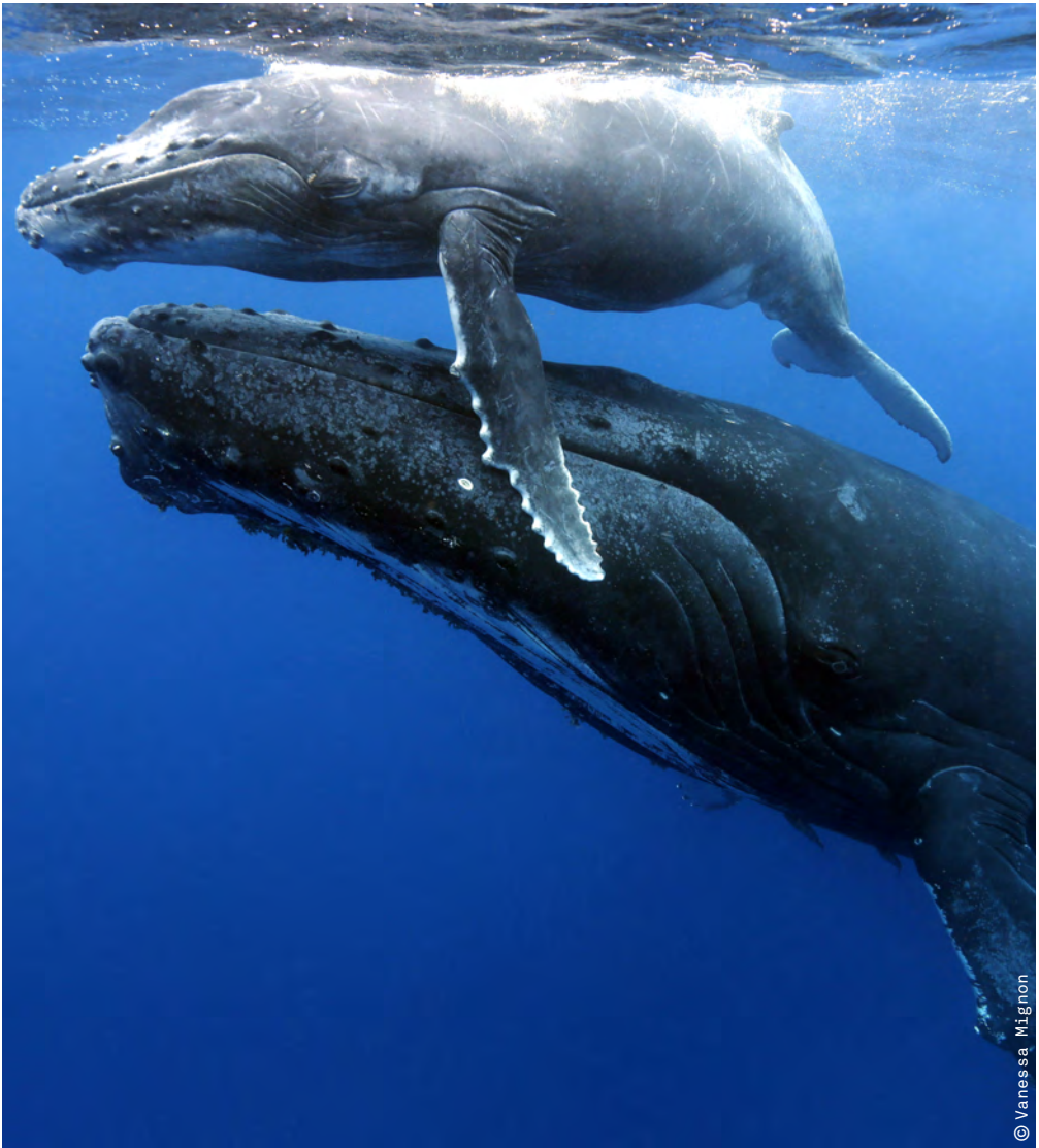
Two humpback whales swimming close together.