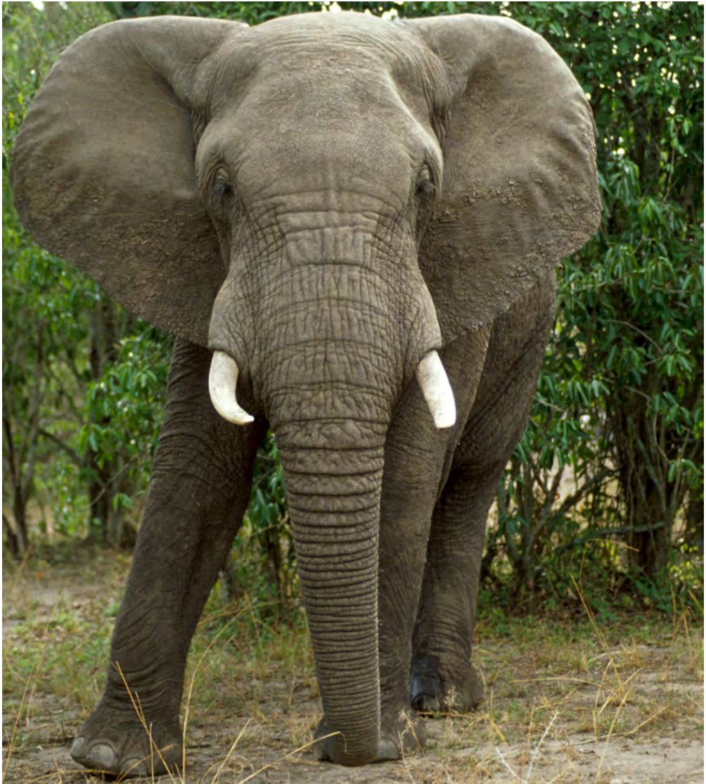
An African elephant in Queen Elizabeth National Park, Uganda.