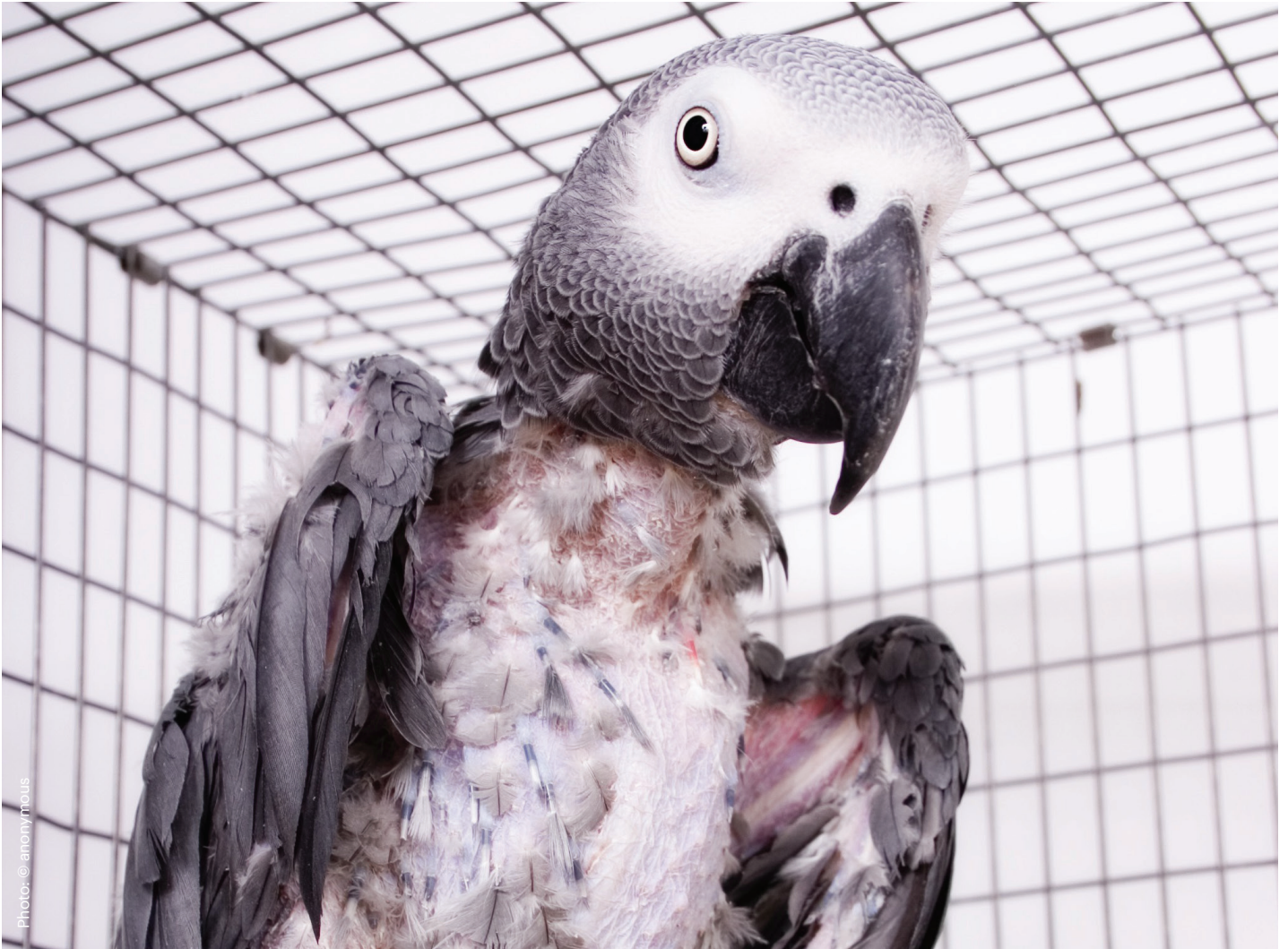
African grey parrot with feathers plucked out in a cage.