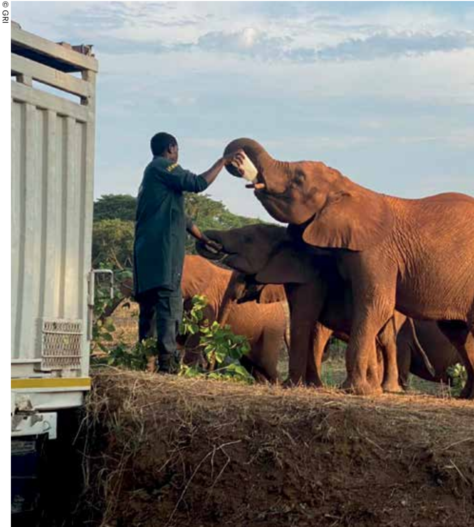
Graduation day! Keepers lured Lani to a truck to transport her to the soft release site in Kafue National Park, one step before life back in the wild.