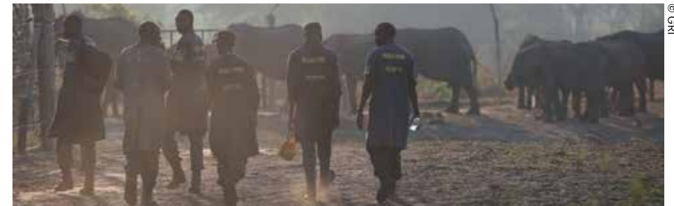
Then one day, she and several of her orphan friends decided to leave and not come back. We monitored them and saw them with a wild herd. Success! You have given her journey the happy ending she deserved. Thank you!

Thank you again for making these beautiful journeys possible. It is said that a person's true nature is in how they treat the less fortunate; I hope you're incredibly proud of the lifesaving impact you make for these orphans.