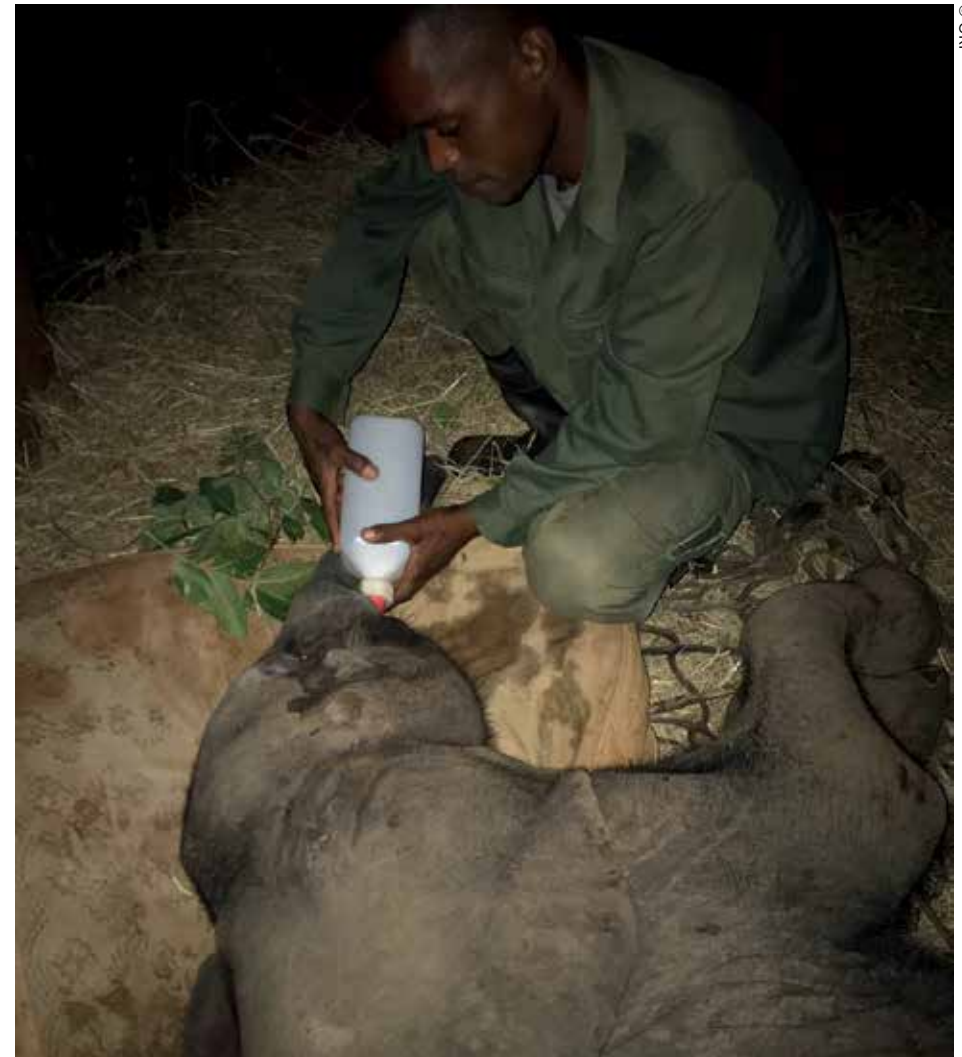
On her first day at the Lilayi Nursery, Lani collapsed from exhaustion. So her Keepers stayed with her in her stable, feeding her bottles as she lay on soft hay. She was safe now, thanks to you.

An orphaned elephant’s journey, from rescue to release, can take 10 years or more. We are so honoured to have your trust in this vital work, and in our mission to save animals and protect their habitats. Thank you.