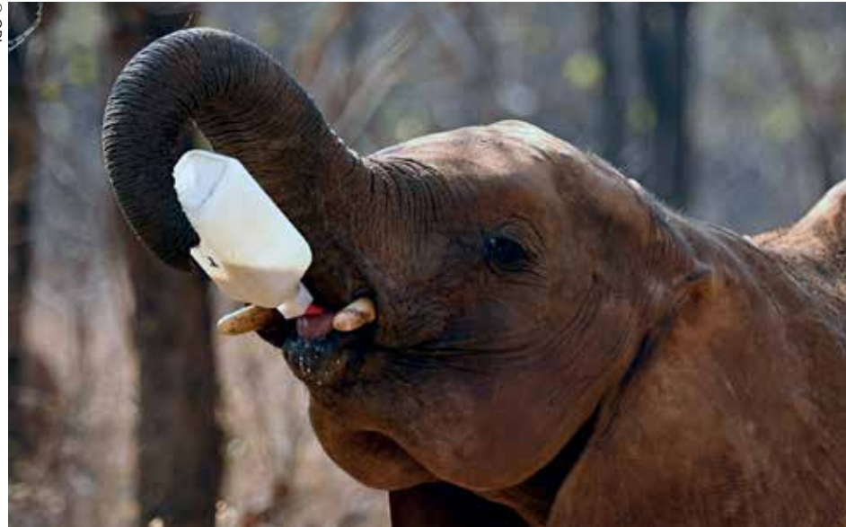
Lani quickly learned how to hold the bottle and feed herself. Thank you for providing this vital nourishment.

Thank you for caring so much for the orphans and being their guardians during their journey back to the wild.