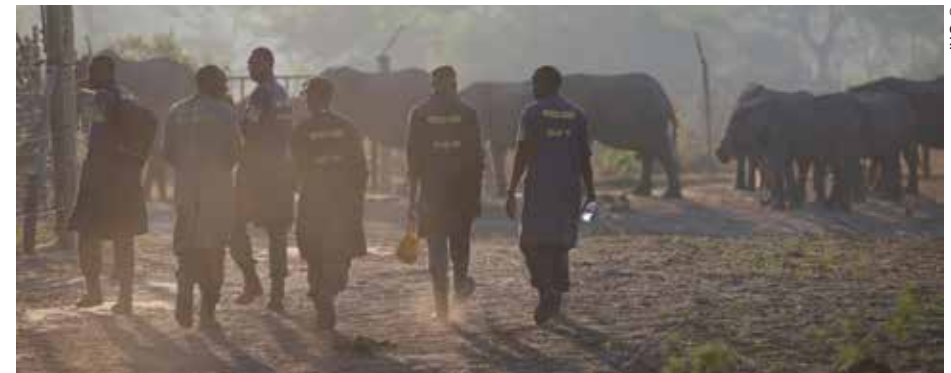
Then one day, she and several of her orphan friends decided to leave and not come back. We monitored them and saw them with a wild herd. Success! You have given her journey the happy ending she deserved. Thank you!

Thank you again for making these beautiful journeys possible. It is said that a person's true nature is in how they treat the less fortunate; I hope you're incredibly proud of the lifesaving impact you make for these orphans.