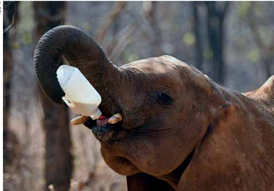
Lani quickly learned how to hold the bottle and feed herself. Thank you for providing this vital nourishment.

Thank you for caring so much for the orphans and being their guardians during their journey back to the wild.