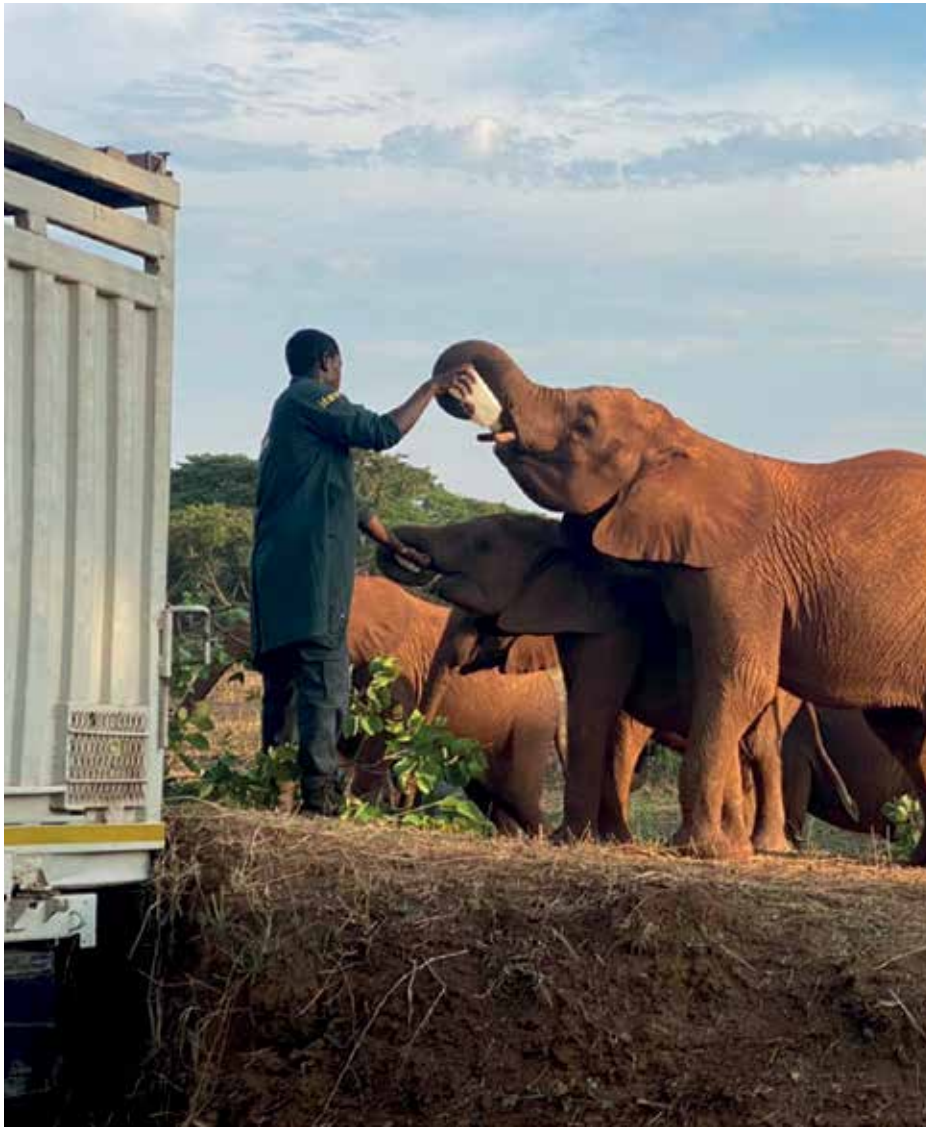
Graduation day! Keepers lured Lani to a truck to transport her to the soft release site in Kafue National Park, one step before life back in the wild.