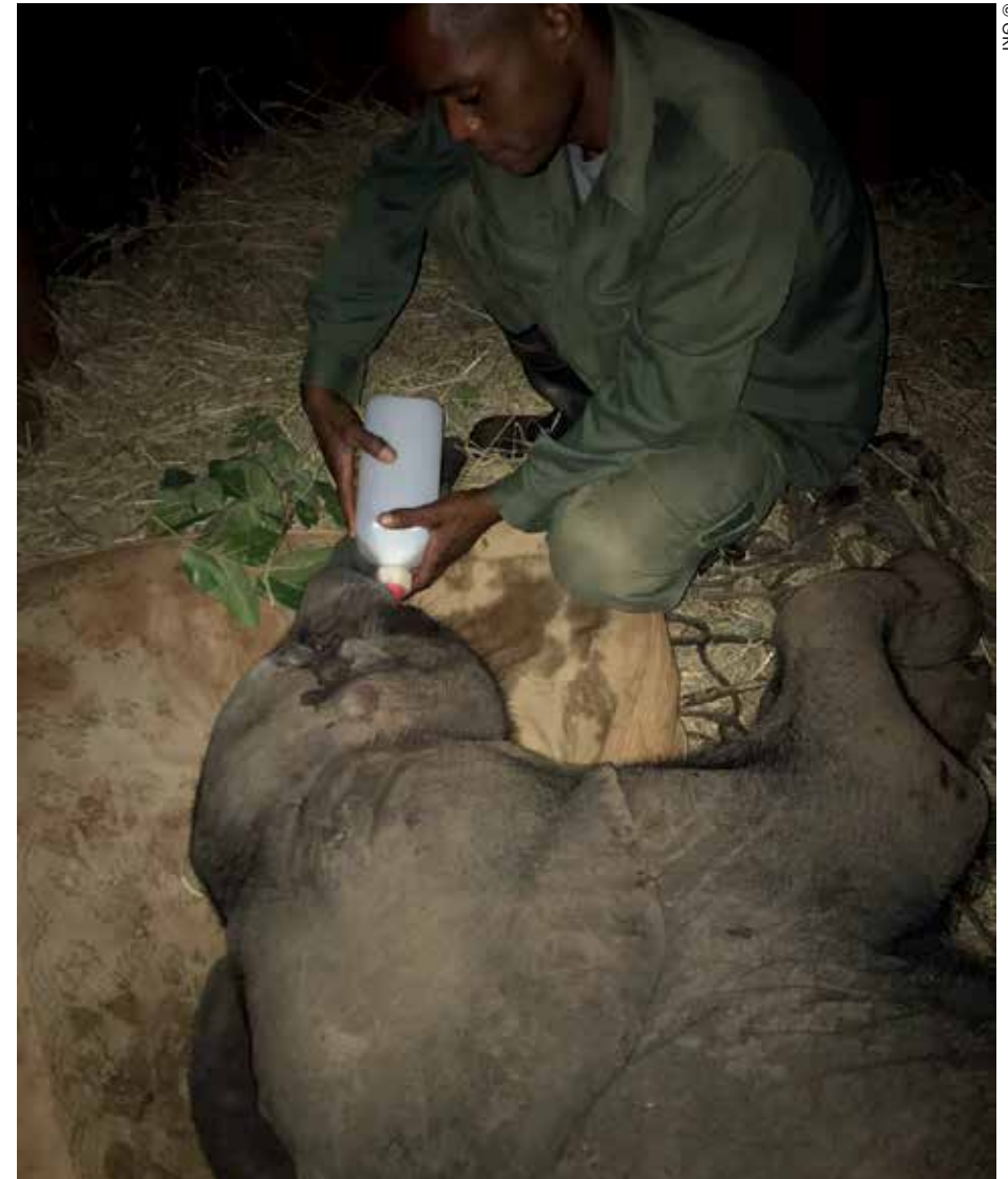
On her first day at the Lilayi Nursery, Lani collapsed from exhaustion. So her Keepers stayed with her in her stable, feeding her bottles as she lay on soft hay. She was safe now, thanks to you.

An orphaned elephant’s journey, from rescue to release, can take 10 years or more. We are so honored to have your trust in this vital work, and in our mission to save animals and protect their habitats. Thank you.