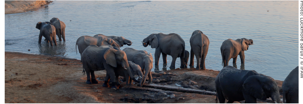
Elephants at the edge of a watering hole in Hwange National Park, Zimbabwe.

To protect these herds and communities, a simple, but effective solution has been established: beehive fences. As with many humans, African elephants are terrified of bees and will avoid them at any cost. Beehive fences have been erected around the eastern border of Kasungu National Park in Malawi to create a natural barrier between elephants and potential