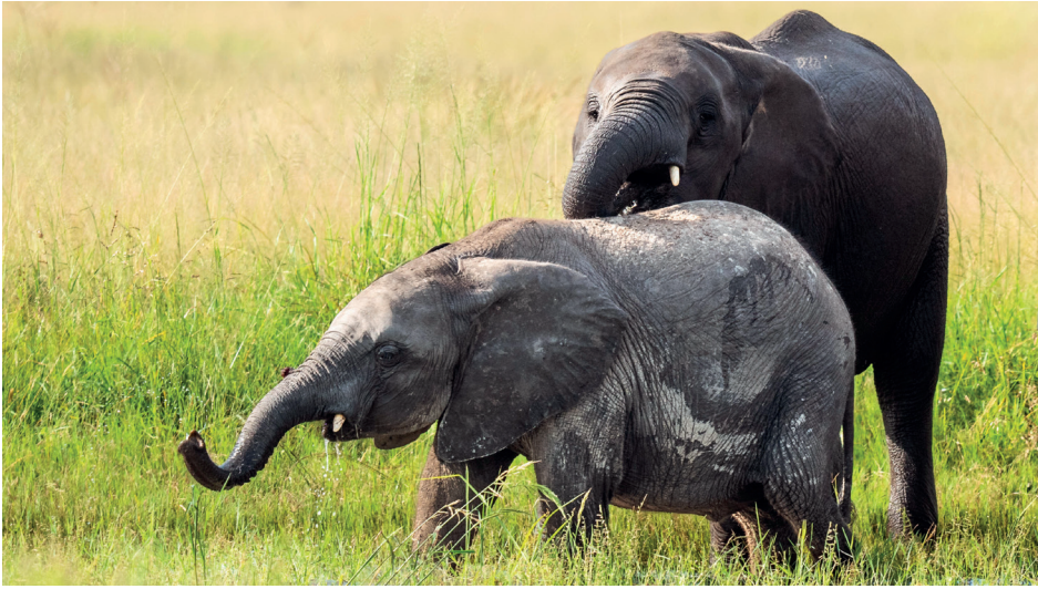
Two elephants enjoying water at one of the watering holes in Hwange National Park, Zimbabwe.