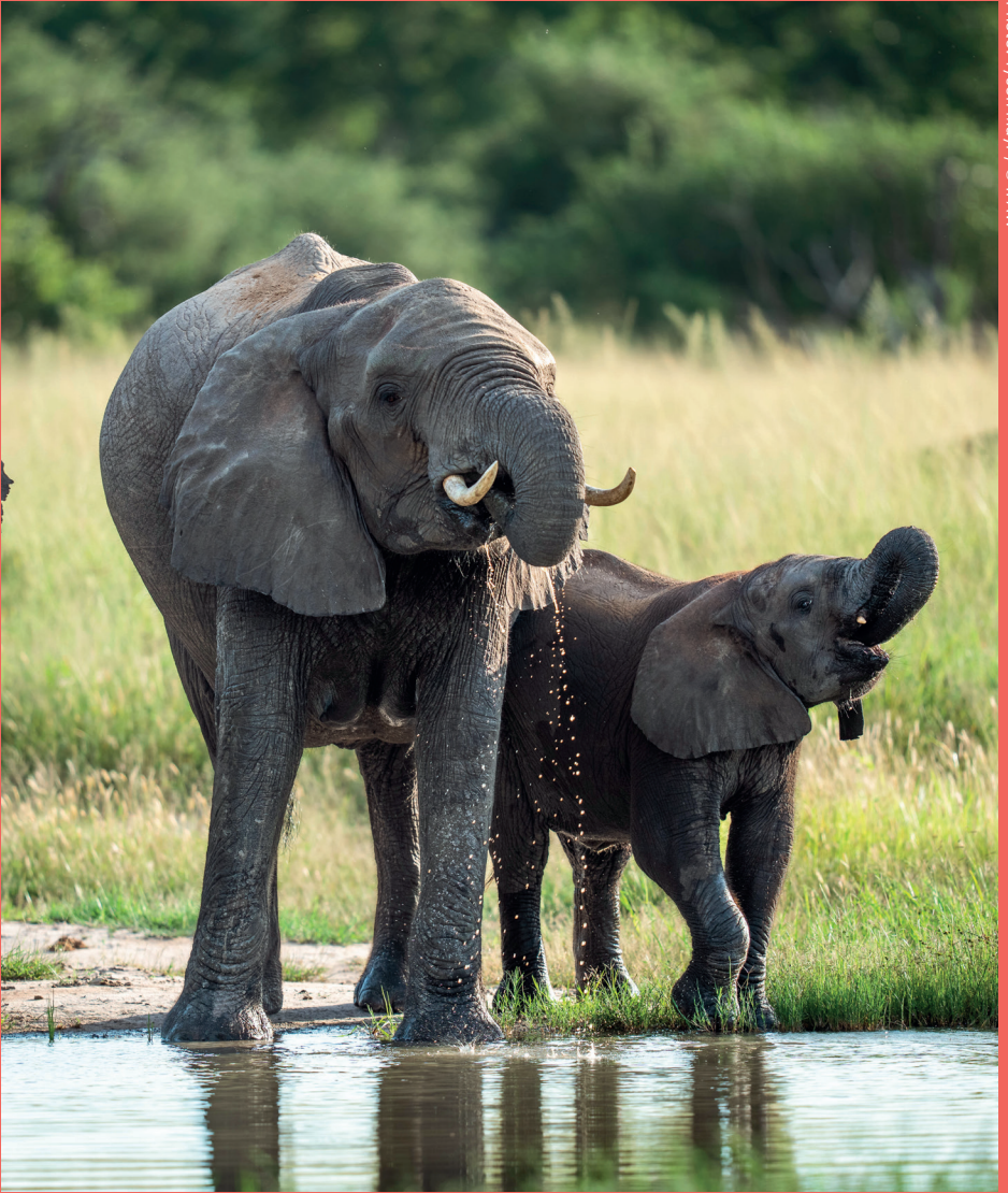
Elephants drink at a watering hole in Hwange National Park, Zimbabwe.