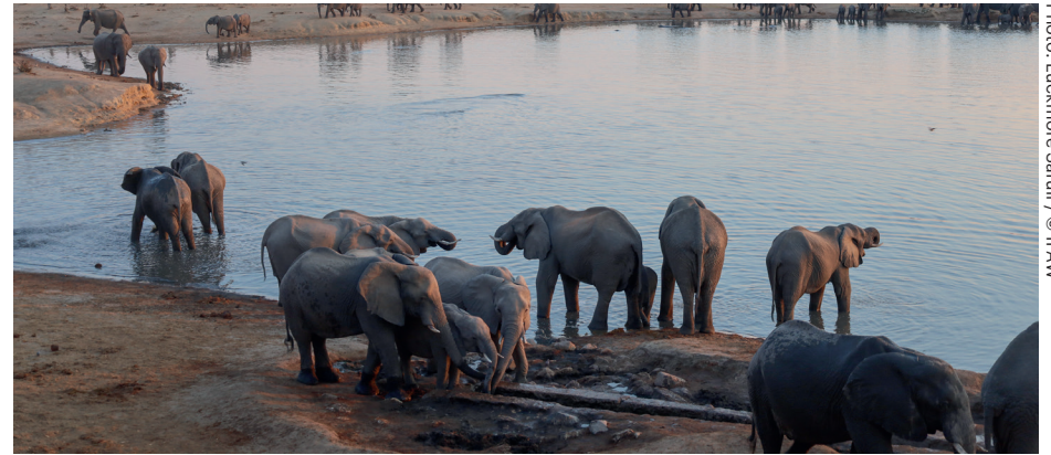
Elephants at the edge of a watering hole in Hwange National Park, Zimbabwe.

To protect these herds and communities, a simple, but effective solution has been established: beehive fences. As with many humans, African elephants are terrified of bees and will avoid them at any cost. Beehive fences have been erected around the eastern border of Kasungu National Park in Malawi to create a natural barrier between elephants and potential