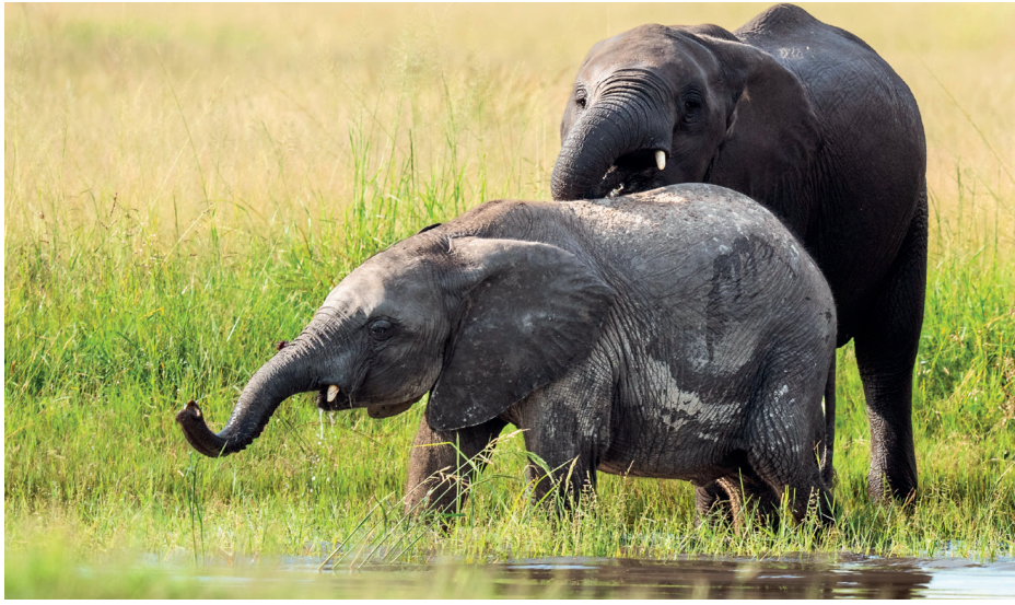
Two elephants enjoying water at one of the watering holes in Hwange National Park, Zimbabwe.