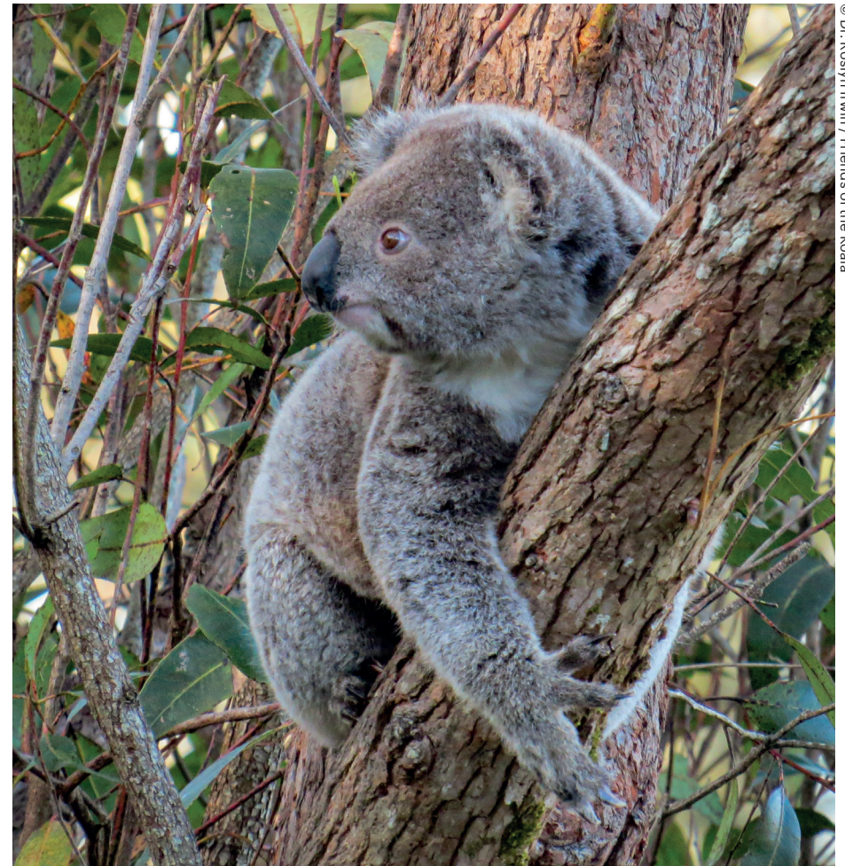
Ember perched on a tree post-release at the Treetops property of Dr. Roslyn Irwin in Caniaba, New South Wales.

► Overall, 89,000 trees have been planted in Australia last year with 7 partners and more than 238 volunteers across four states.