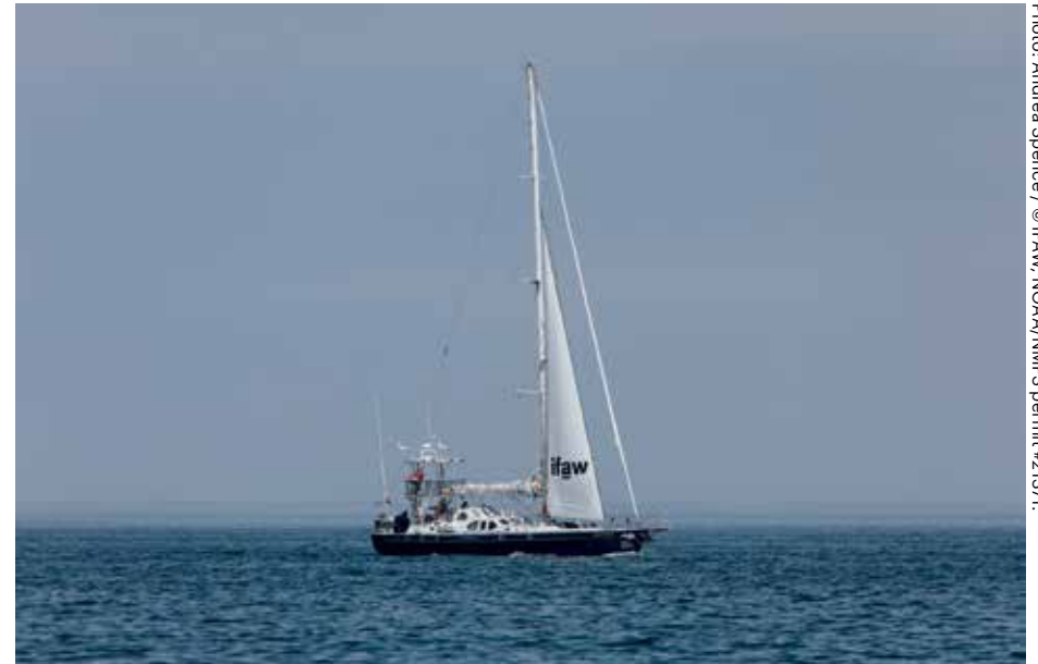
The Song of the Whale research vessel off the coast of Cape Cod.

Additionally, IFAW has lobbied state and federal officials to increase funding and regulations that support a transition to on-demand gear. In April, history was made when two fishermen received new technology used to signal the acoustic release of on-demand gear. Leveraging our work in the field with early adopter lobstermen, we have separated ourselves from other organizations both within the policy sector and the fishing industry as an organization that is taking a holistic approach to solve this dire problem.