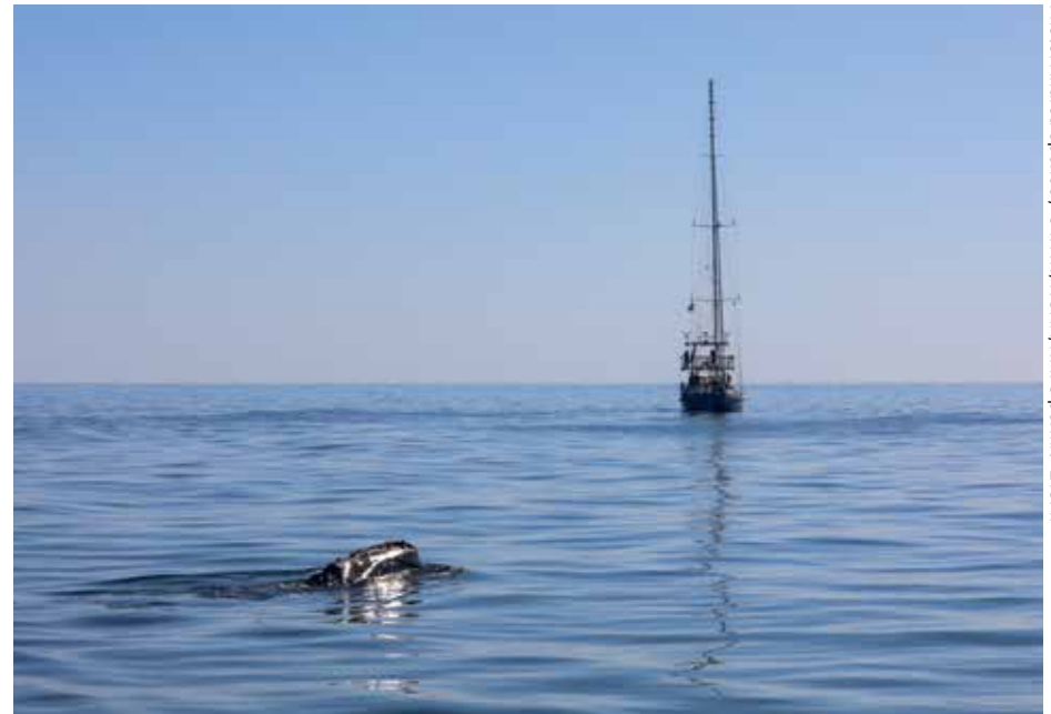
A North Atlantic right whale surfaces near Song of the Whale in Cape Cod Bay.

Approximately 83% of right whales have experienced entanglement in fishing gear at least once in their lifetime, while entanglement-related deaths have accounted for 85% of diagnosed mortalities since 2010. When these whales first encounter vertical lines, their natural instinct is to roll and tumble causing the gear to constrict around them. Wrapping around the whale’s flippers, tail, head or mouth, the line produces deep lacerations and even partial amputations of the flippers, often leading to an inability to feed properly leading to emaciation. The process of entanglement itself causes immediate, traumatic drowning events in some cases and prolonged, painful deaths in others. This process and its subsequent