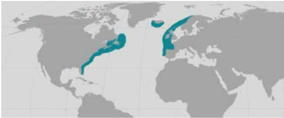
Map of the North Atlantic right whale's previous population. Due to entanglement and vessel strikes, they are now only located on the east coast of the United States.