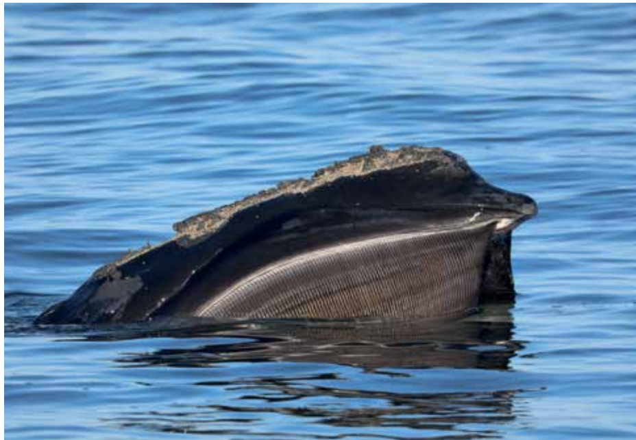
A North Atlantic right whale ‘skim feeding’ with baleen clearly visible in Cape Cod Bay.