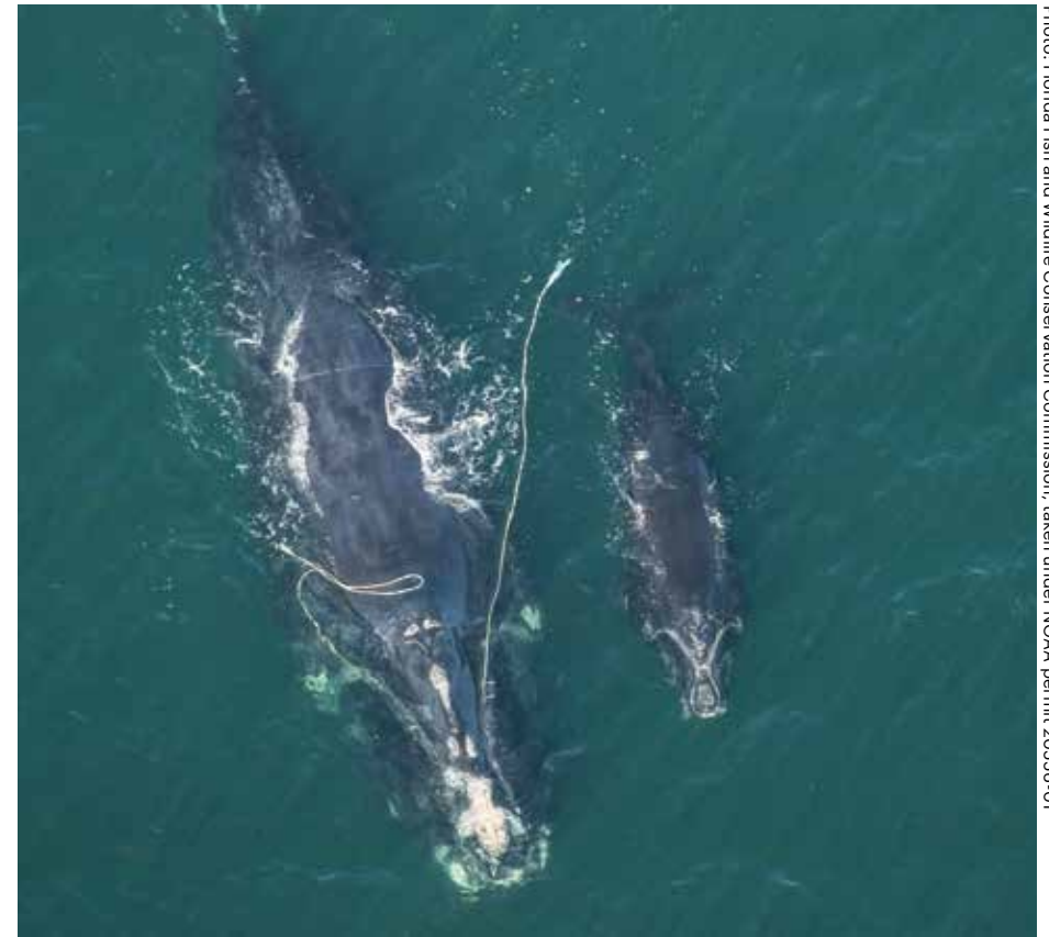
An entangled whale named Snow Cone, spotted off the coast of Florida with her calf.

Now, the North Atlantic right whale is one of the most endangered animals in the world. They are on the brink of extinction, listed as ‘Critically Endangered’ on the IUCN Red List, with an estimated population of 340 and only a quarter of those remaining are reproductive-aged females. In other words, only 70 are capable of producing more calves. With a 12-month pregnancy, regrowth of the population is limited and slow. This means the death of even one animal can have a critical impact on the species’ survival.