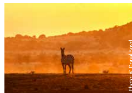
▲ Zebra at sunset in Kitenden Conservancy, Kenya.

But perhaps the best proof is the fact that thousands more landowners signed the agreement in 2021, www.ifaw.org/international/press-releases/secure-space-wildlife-kenya , bringing the total conservation area to over 55,000 acres.