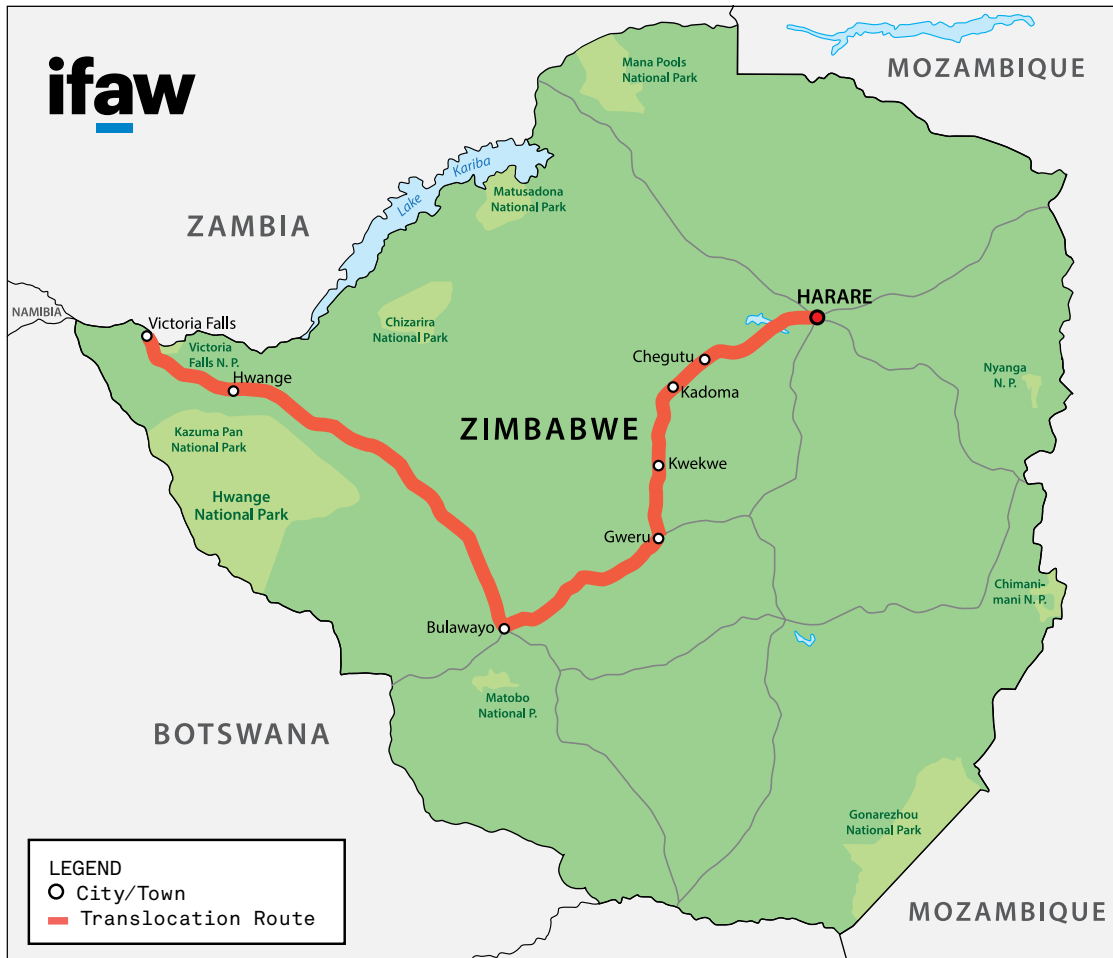
Map showing the route of the elephant translocation through Zimbabwe.