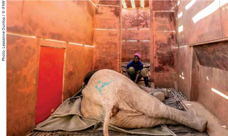
Amira loaded and ready to be woken up for the journey