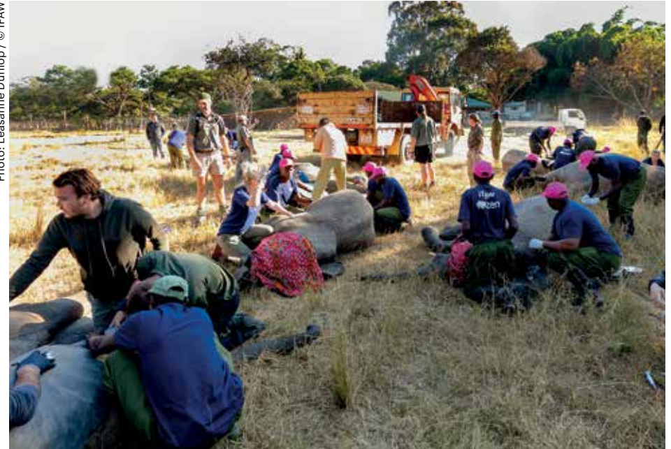
All hands on deck while the elephants are sedated to prepare for their translocation.