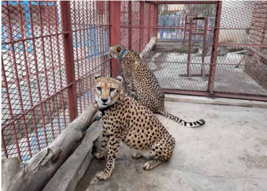
The two adult cheetahs were confiscated by the concerned authorities from a smuggler on the Yemeni-Saudi border and taken to the Sanaa Zoo.