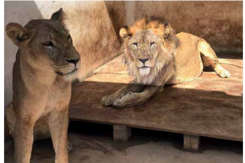
A lion and lioness sitting under the sun at the zoo in Yemen.

Thanks to you, we have been able to take several steps forward in making sure these animals receive the proper care and nutrition they require. We are incredibly optimistic about the continued progress these animals will make in 2021!