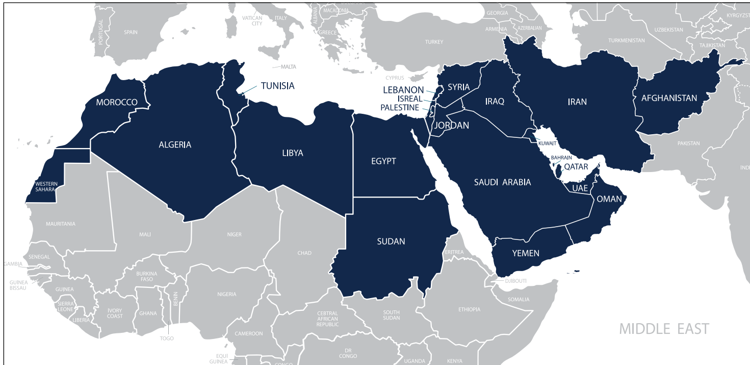
Map of the geographical location and surrounding areas of the two zoos.