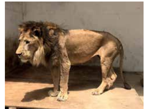
Tired and emaciated lion at the zoo in Yemen during the first stages of support provided by IFAW.

it quickly became a strong partnership between the two factions.