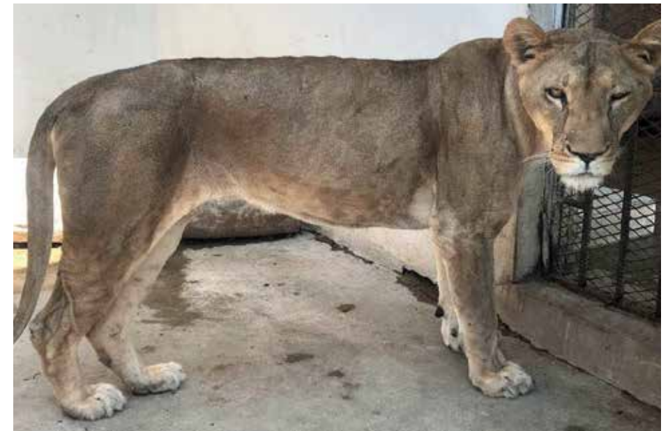
An improved lioness at the zoo in Yemen after receiving food and medical supplements, which were provided by IFAW.

A final update we can share on this project is that we received enough donations to not only extend the grant duration to continue supporting the carnivores in Taiz zoo, but also working to include another zoo (Ibb zoo) in Yemen to support the animals there.