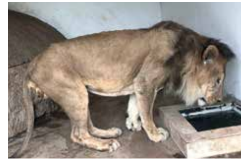
A "before" picture of a lion drinking water during the assessment stage carried out by IFAW.

The government will not allow the animals to be moved out of the country, making our partnership with the zoos and their keepers even more critical. One of the first barriers we had to face was that in Yemen basic resources (food and medical supplies) are lacking and hard to find. Additionally, we had to form a relatively new trusting relationship with the zoos. Establishing trust is a slow process, but as the end goal was the same for everyone involved,