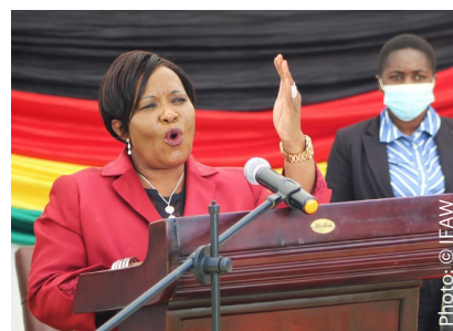
▲ First Lady Dr. Auxillia Mnangangwa, Zimbabwe's Wildlife Ambassador and Environmental Patron.

"To our partners, do not tire, let us put our heads together and work as a team," the First Lady urged.