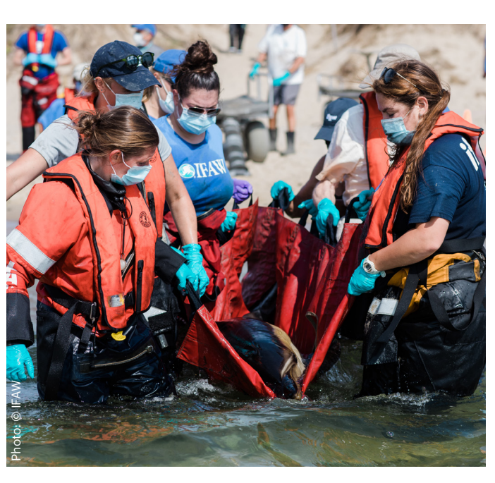
mission: fresh thinking and bold action for animals, people and the place we call home.