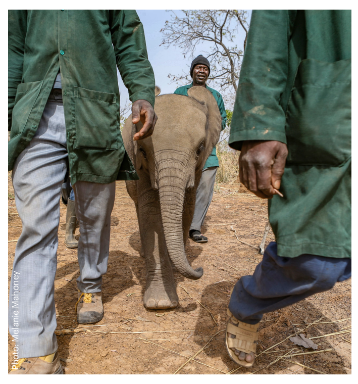
vision: animals and people thriving together.